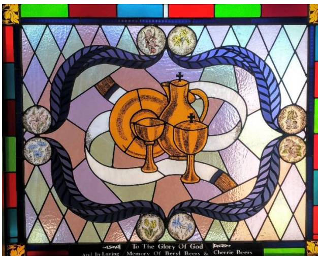
Stained glass window in the Sacristy at St. Luke's.

Our Mission: To know Christ and to make Christ known